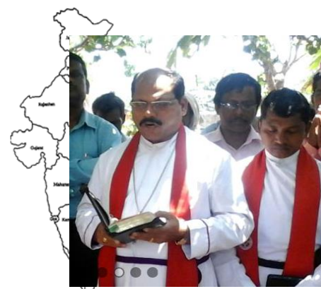
Rt Rev S R Nanda, Bishop of Cuttack

The state of Orissa - the Cuttack Diocese is along the eastern strip